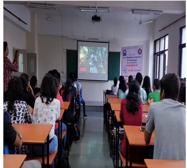
Students screening film on Odisha history