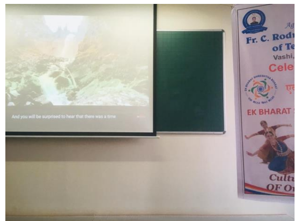
Students screening film on Odisha tourism